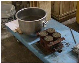
"CMU" cylinders manufactured in lab

Cement, sand, and admixtures were standard materials used in the commercial manufacture of concrete masonry units in the Milwaukee area.