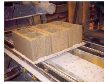
CMU coming out of block machine in plant